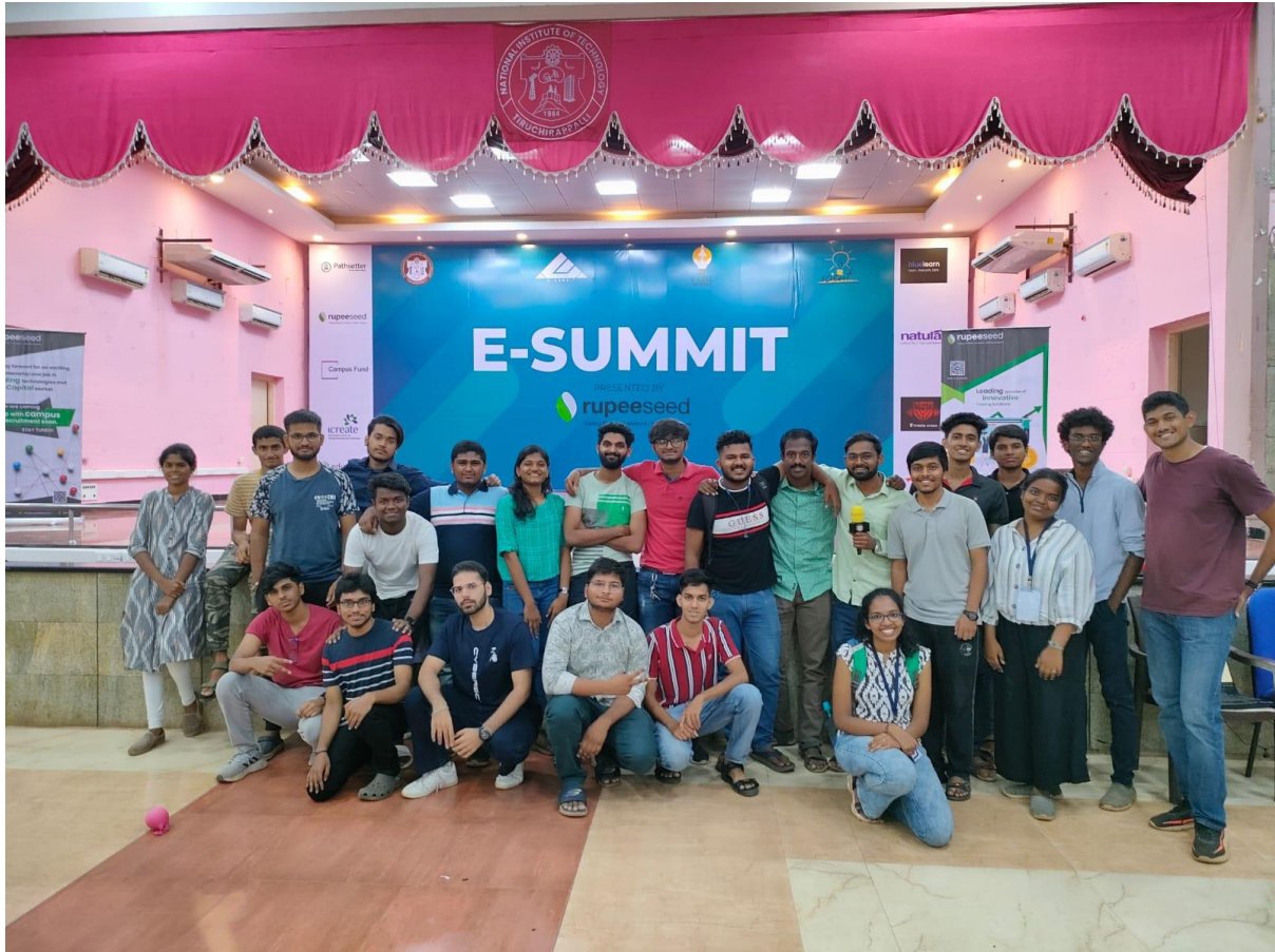
Footfall for E-Summit: 1000+ Across multiple colleges including NIT Trichy